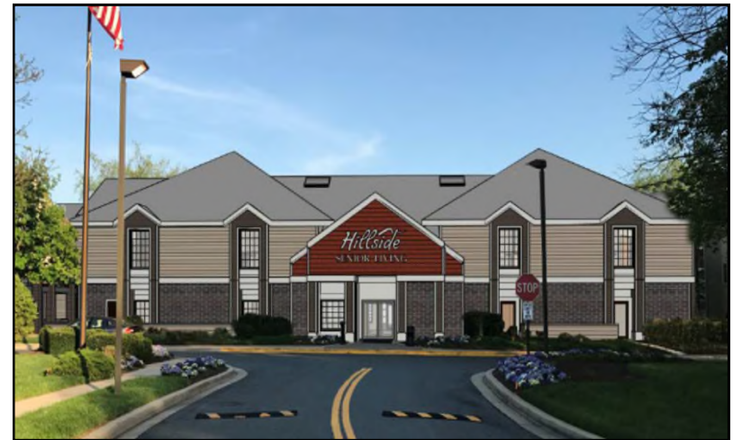
Rendering of Hillside Senior Living with new exterior façade, post renovation.